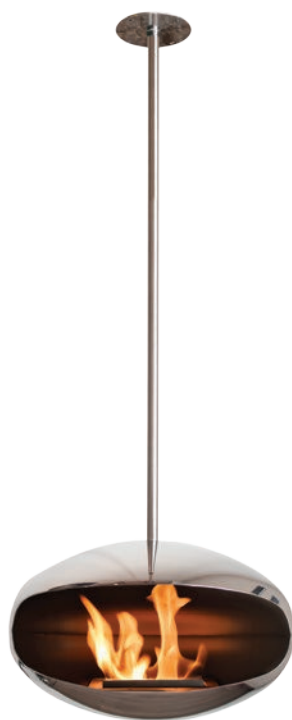
CFASS with 316 Stainless Steel Hanging System